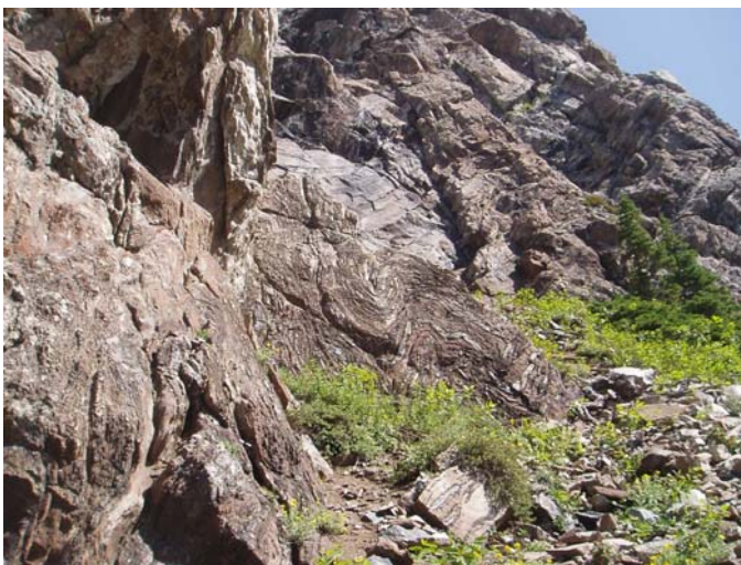
Figure 1a Folds

We are studying how people develop this skill. One avenue of our research has been to study mental transformation in experts. Strong mental transformation skills are essential in the field of geology. Geology is a historical science that takes what is observable and tries to deduce what has happened over time to result in the current state of affairs. In particular, geologists use the present spatial relations to figure out what transformations have occurred. This mental reasoning may take place at many scales, from tectonic to microscopic. For example, field geologists study the deformational history of rocks and regions by studying the spatial configuration of geological features in an outcrop and how they fit with other observations in a surrounding area. Just as the bent and rent metal of a car tells a story, so too the geological history is revealed by the bends and breaks, folds and faults, in rocks. (see fig. 1).