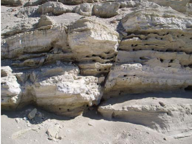
Figure 1b Faults

The current line of research aims to understand how expert geologists reason about mental transformations. Geologists self-report that they look at an outcrop and play back in their mind the sequence of transformations, mentally animating the transformations from the present spatial configurations back to horizontal sedimentary layers. An initial study examined if geologists are objectively able to make such mental transformations, and, if they are, is the skill domain specific or domain general. Previous studies of chess expertise (Chase & Simon, 1973) suggest that expert reasoning is domain specific, in which case geologists should only be able to perform mental transformations on objects that have been altered in geologically relevant ways. In contrast, if geologists are able to perform mental transformations on any object independent of the type of alteration it suggests they have a domain general skill.